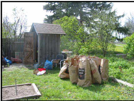
Spring cleanup. Just a few of the many bags full of debris