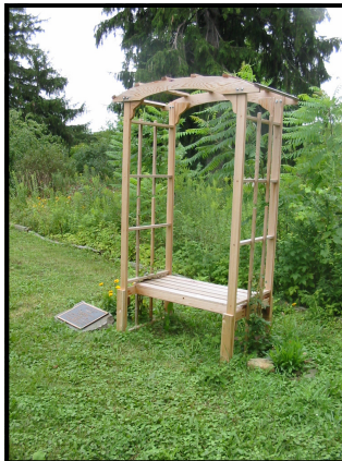
The arbour bench dedicated to Joan Reid